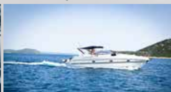
MARINE & LEISURE BOAT