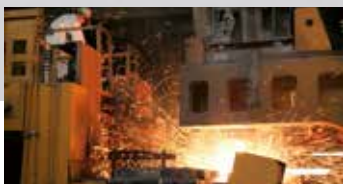
MANUFACTURING & MACHINE TOOLS