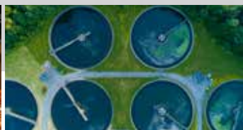
WATER & WASTE WATER MANAGEMENT