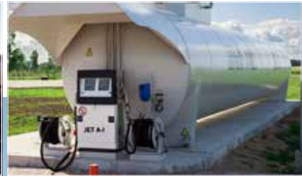
Over wing fueling Small & very small airports