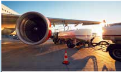
Trailer refueller Most of the commercial airports