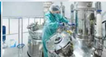
CHEMICAL FLUID TRANSFER