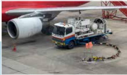
Hydrant dispenser World largest