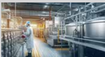
FOOD & BEVERAGE PRODUCTION